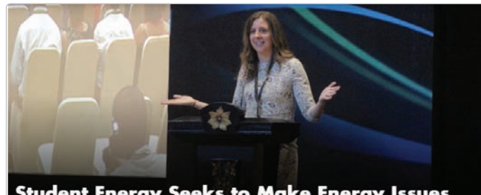
Student Energy Seeks to Make Energy Issues Simple

Student Energy believes in the importance of collaboration and partnership for advancing a sustainable energy future. In 2015, Student Energy worked collaboratively with a number of initiatives to bring the youth voice to the global energy conversation.